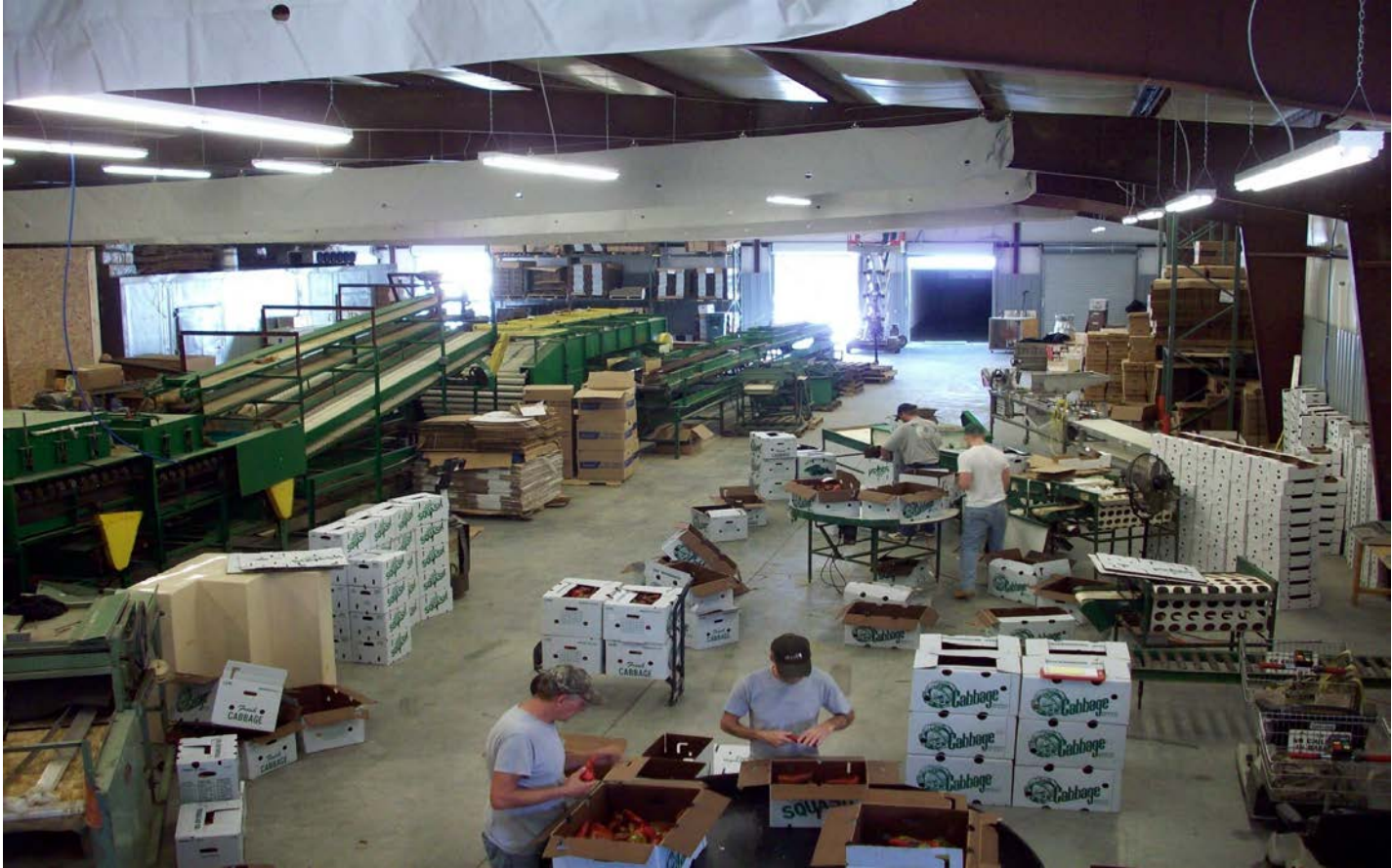
Regional Food Hub