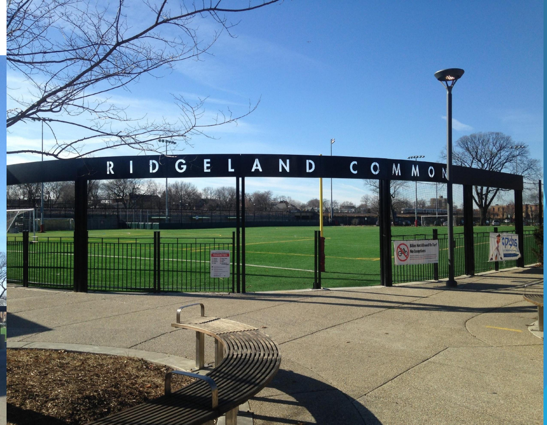
Ridgeland Common Solar System